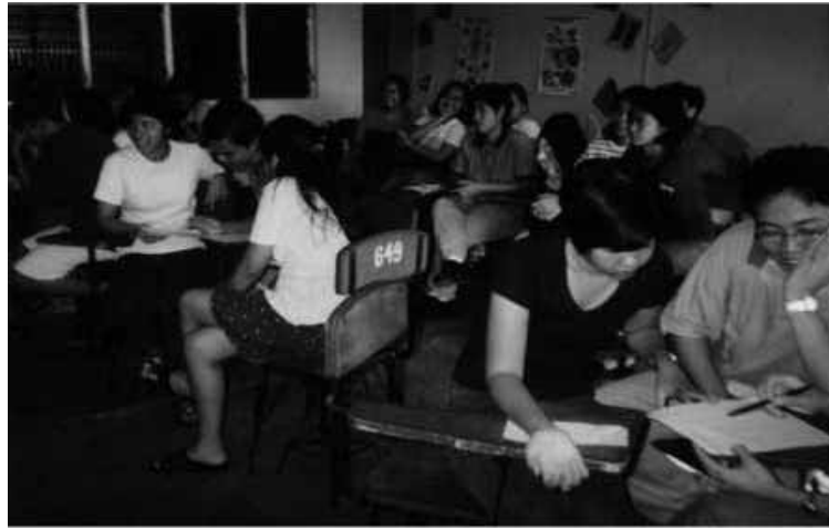
Teachers enjoying their Faculty Development Program last May at the New Amcan Hall.